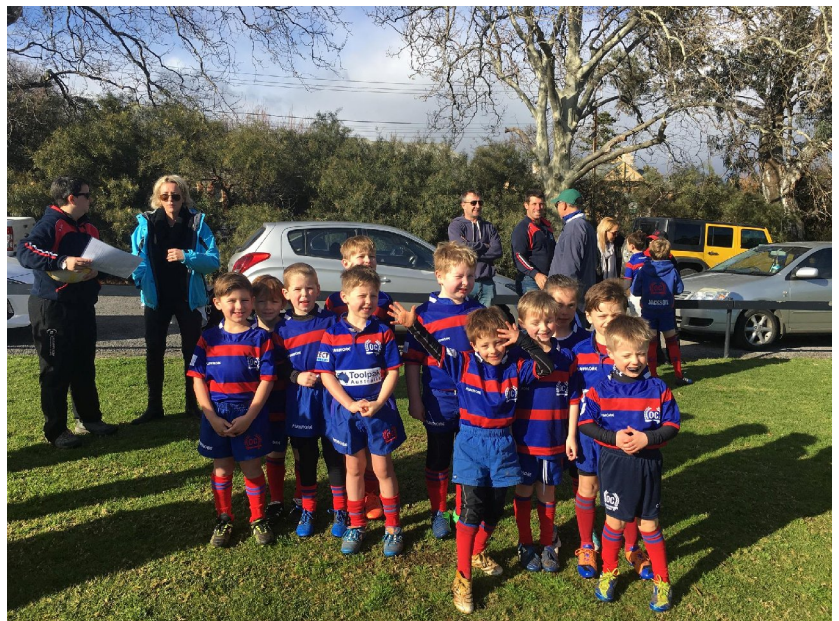
Under 8's also enjoyed their Gala Day games